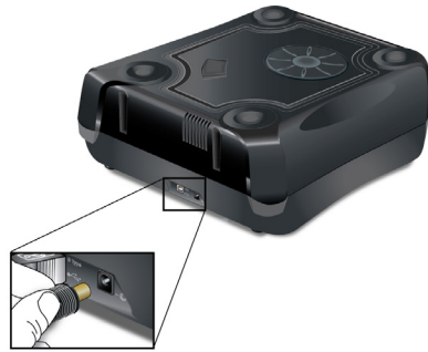
Figure 2 Connect the Vault Power Supply to the Vault